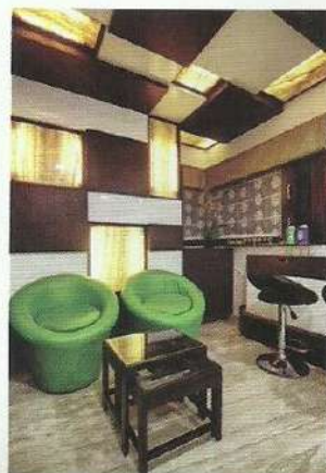
green furniture at the bar lounge