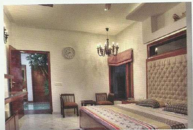
a play of browns and off whites in the bedroom

The courtyard has a sunken pebble bed with glass top, which acts as a stage hosting the court. Italian stone "Diana" has been used throughout the flooring, with its grains leading to the court. Wooden flooring is also used at places to add warmth. A lot of sit-outs have been planned and placed at various intervals within the house to add story. Extensive use of jali can be seen as partitions which are then repeated in furniture as well. The ceiling of the lobby leading to the court is finished with veneer backed by commercial board which follows through the glimpses of backlit onyx stone in Puja, sea green lacquered glass in kitchen, as well as a wall of wallpaper in the dining. Traditional