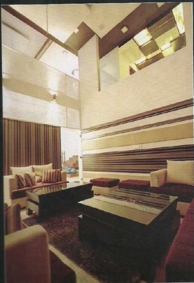
the volumes and voids creating interesting patterns