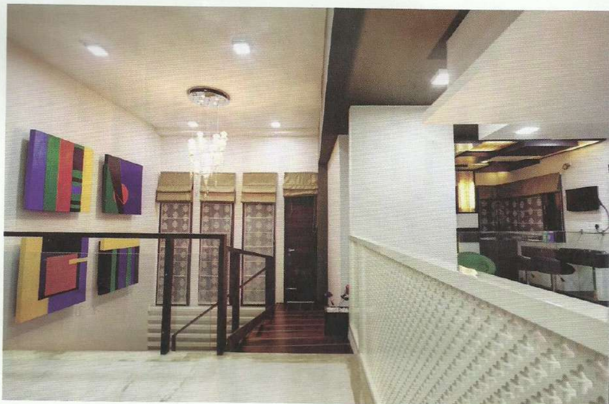
the first floor lobby