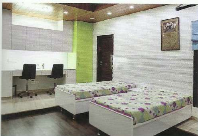
custom designed kids room; furniture adding to the youthfulness